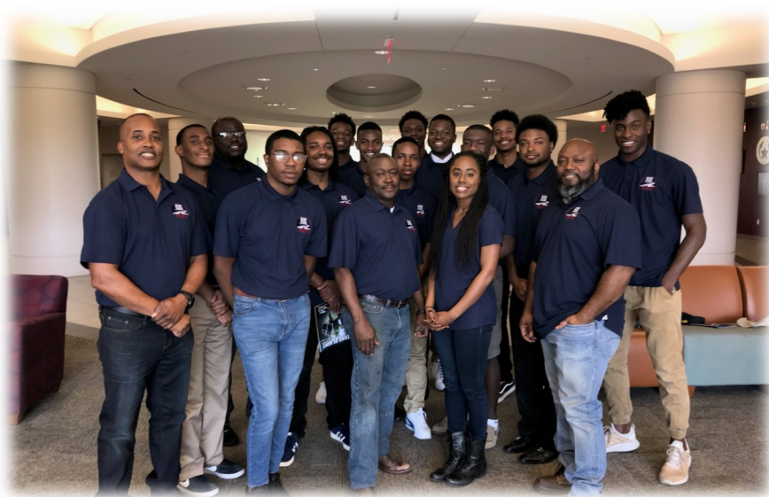
PATH (Personal Achievement Through Help)